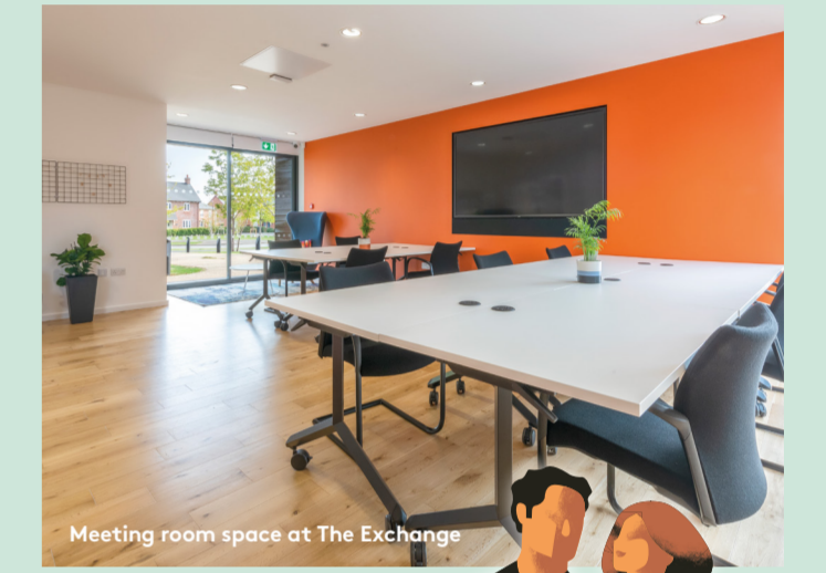
Meeting room space at The Exchange