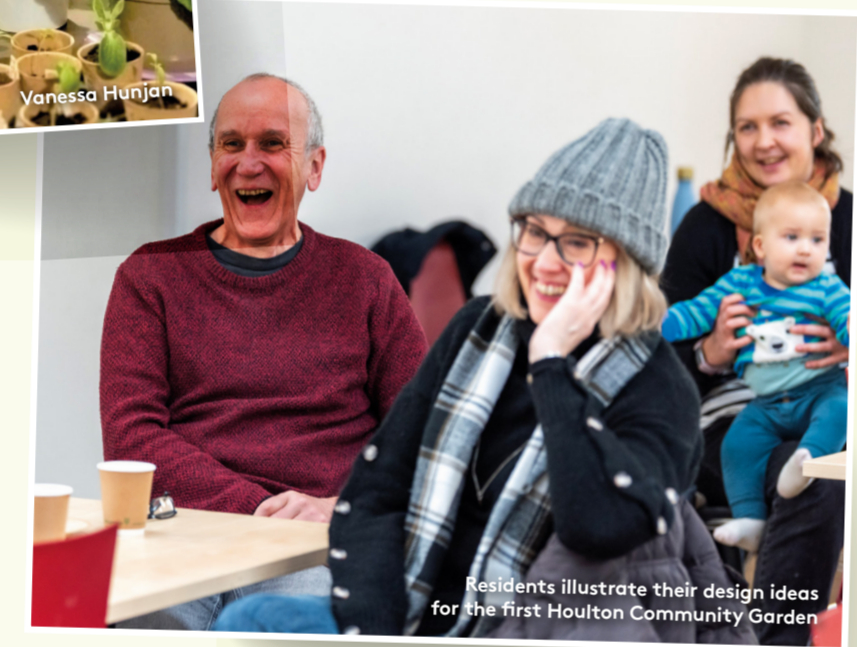
Residents illustrate their design ideas for the first Houlton Community Garden