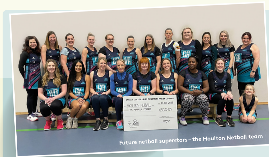
Future netball superstars - the Houlton Netball team