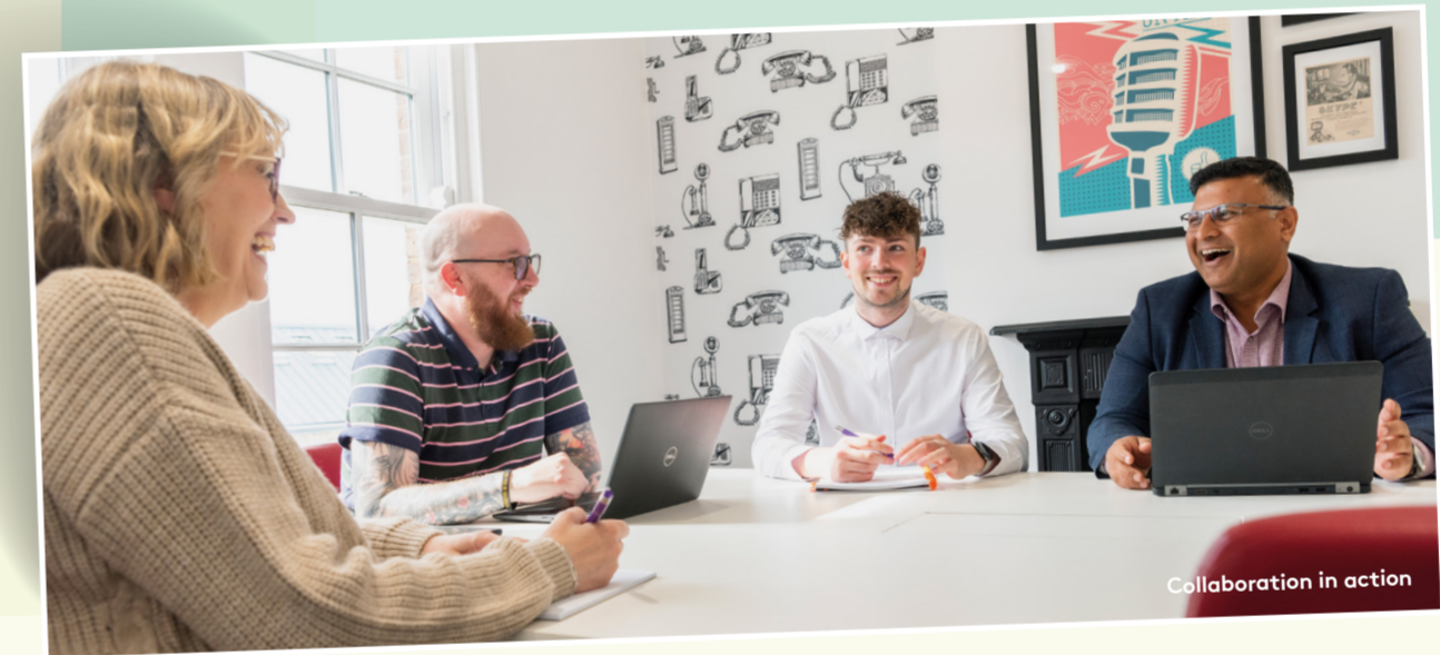
Collaboration in action