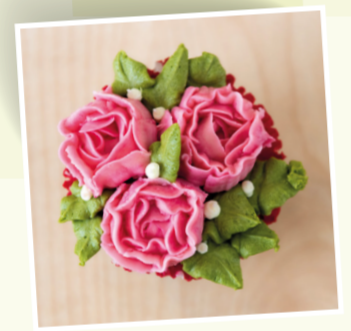
Cupcakes supplied by Inclusive Bakes