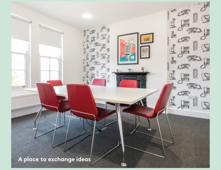
A place to exchange ideas