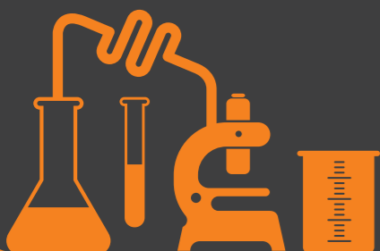
Image 6 Present day, we have come to recreate what others have done long before... and the bangs begin.